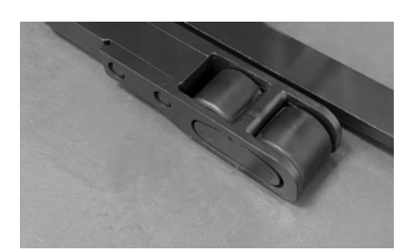
Bolt-On Load Wheel Boxes